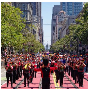
SF GLBT Freedom Band

PRIDE month in San Francisco is always a very busy one for most sports and cultural clubs, and this year was no exception, with PRIDE runs, walks, meetings, performances, and of course the annual San Francisco PRIDE Parade which took place on Sunday June 30.